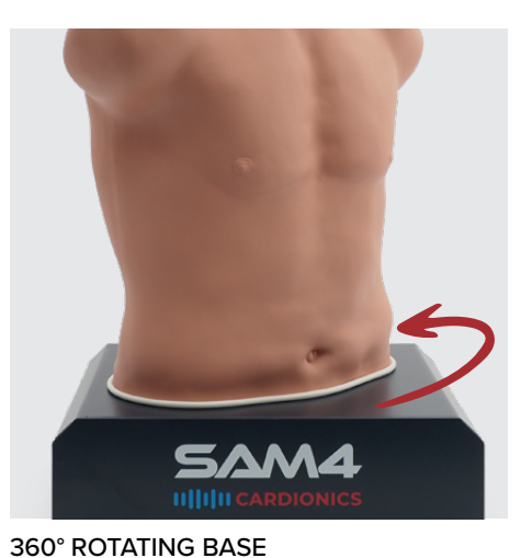
Facilitates demonstration and examination for multiple users