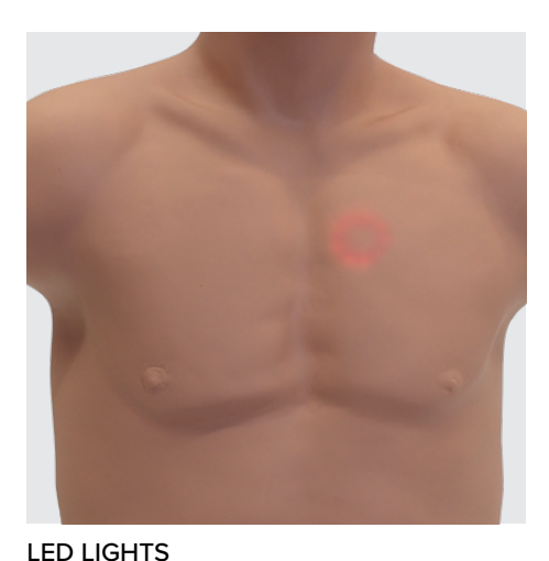
Optional in all auscultation points to help students