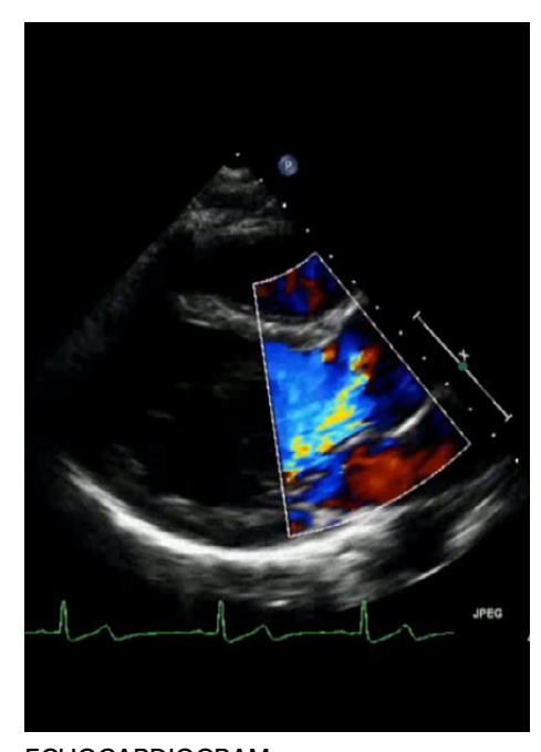
ECHOCARDIOGRAM Enhances the comprehension of certain conditions