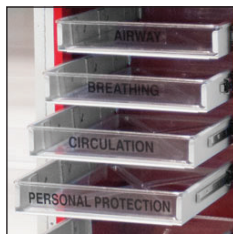
Drawer Labels ER-LBL