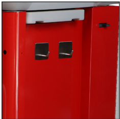
Utility Hooks ABH-2