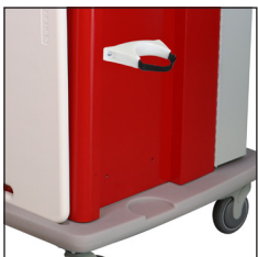
Oxygen Tank Bracket O-2