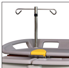
IV Pole & Bracket IV-2-ER