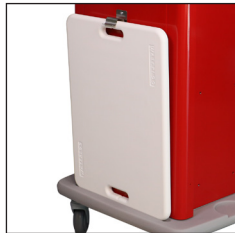
Cardiac Board/Bracket CBB-ER